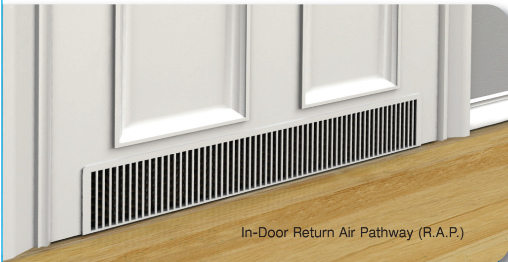
In-Door Return Air Pathway (R.A.P.)