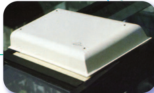
Outside view, available in white or brown.

TC1000-H is an innovative design in whole house ventilating. The system is engineered to efficiently reduce the indoor temperature of your entire home.