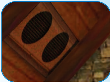
Inside view, available in white or brown.

TC1000-H Ventilator The TC1000H is the only ventilating fan designed and assembled in the USA for use in a solid roof or wall application. Perfect for A-Frame construction or for homes that don't have an attic. Two energy efficient fans move 800 cubic feet of air per minute. A motorized insulated damper seals when the fan is not in use preventing cold air, insects, and the elements from entering your home. The TC1000H is one speed, comes equipped with a wall switch, is maintenance free, carries a three year warranty and is Underwriters Laboratory approved.