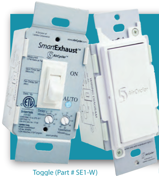
Toggle (Part # SE1-W)

The SmartExhaust™ Bath Fan/Light Switch is a simple and efficient solution for achieving adequate bathroom ventilation and meeting exhaust ventilation requirements. The SmartExhaust™ is designed to replace the bathroom fan and light switches with one smart controller and features programmable settings for running the exhaust fan as much or as little as you want, automatically.