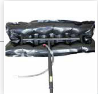
18" x 38" Brick Fireboxes Rectangle Dampers