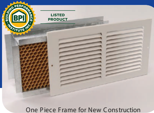
One Piece Frame for New Construction