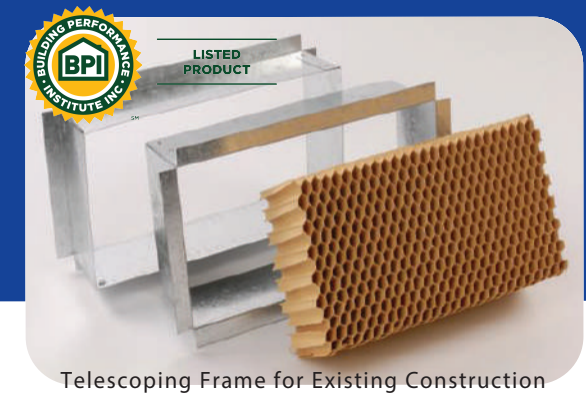
Telescoping Frame for Existing Construction