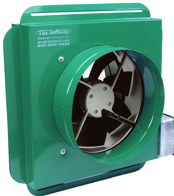
Optional Filter Box